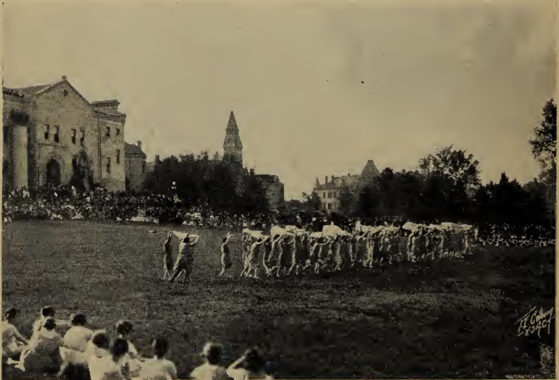
May day, 1920—more college life