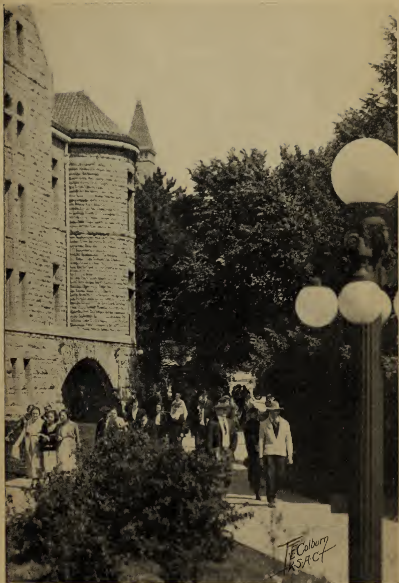
The parting of the ways—both of which lead to chapel