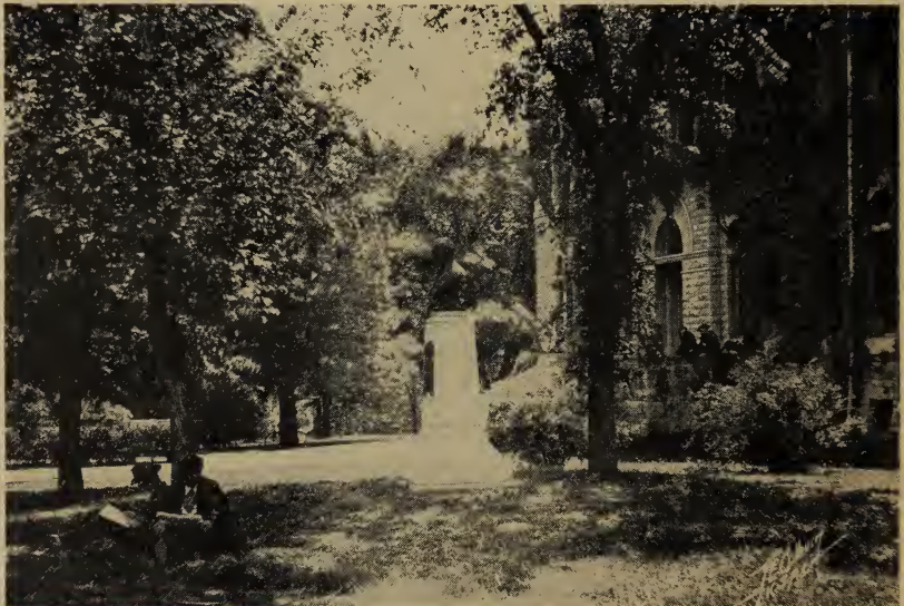
The College honors a leader in agriculture