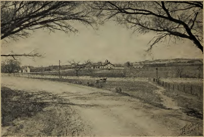
down on the farm