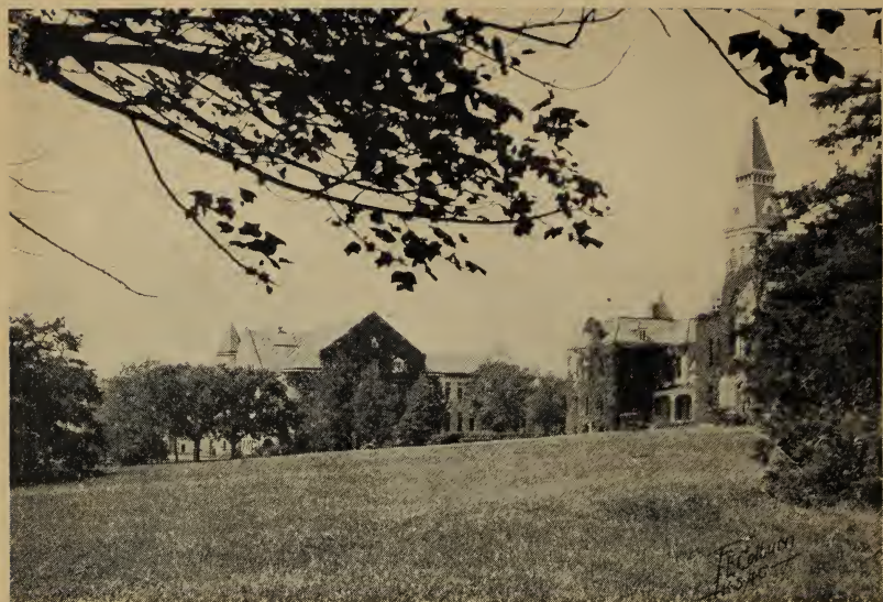
From the edge of the hill