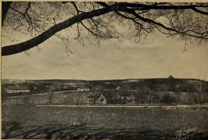
Over the hills and away