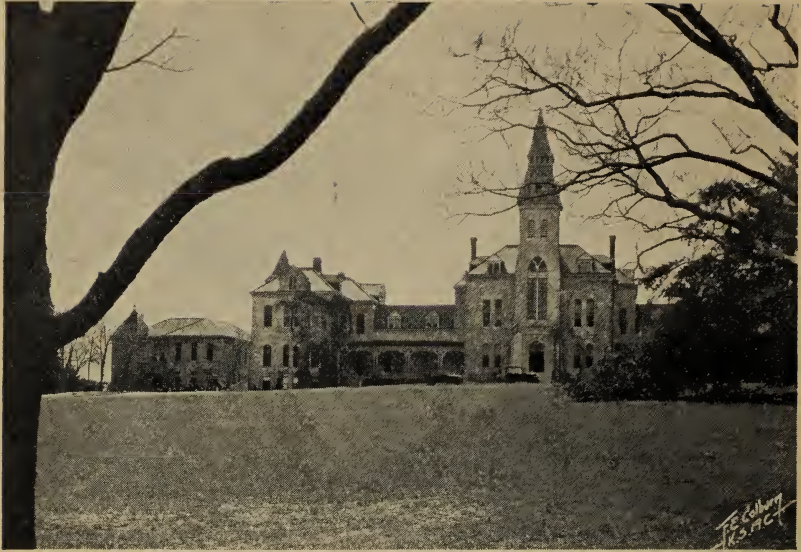
Anderson Hall—the center of college life