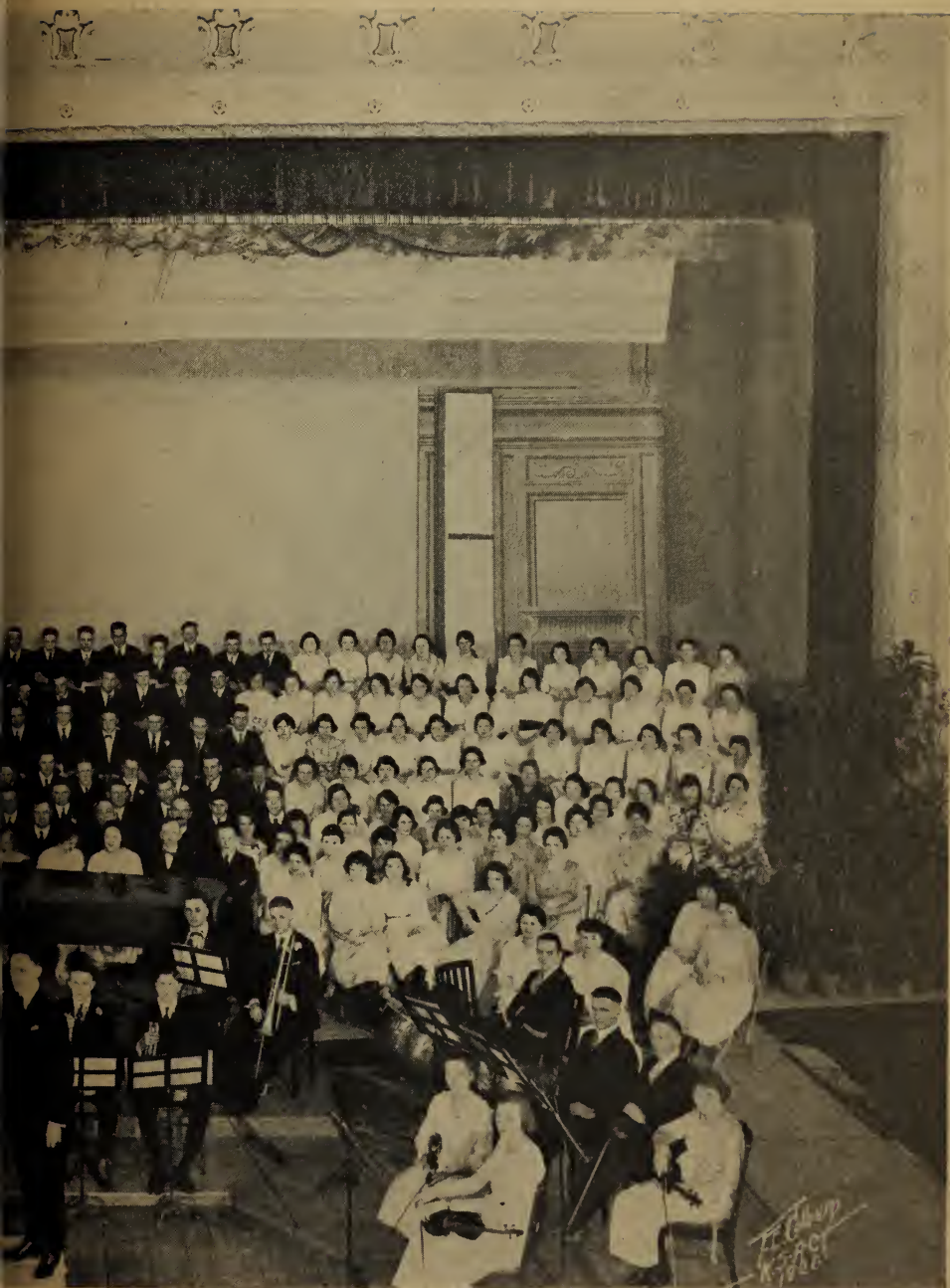
ION AND ORCHESTRA S. Coleridge Taylor, May Festival, 1920