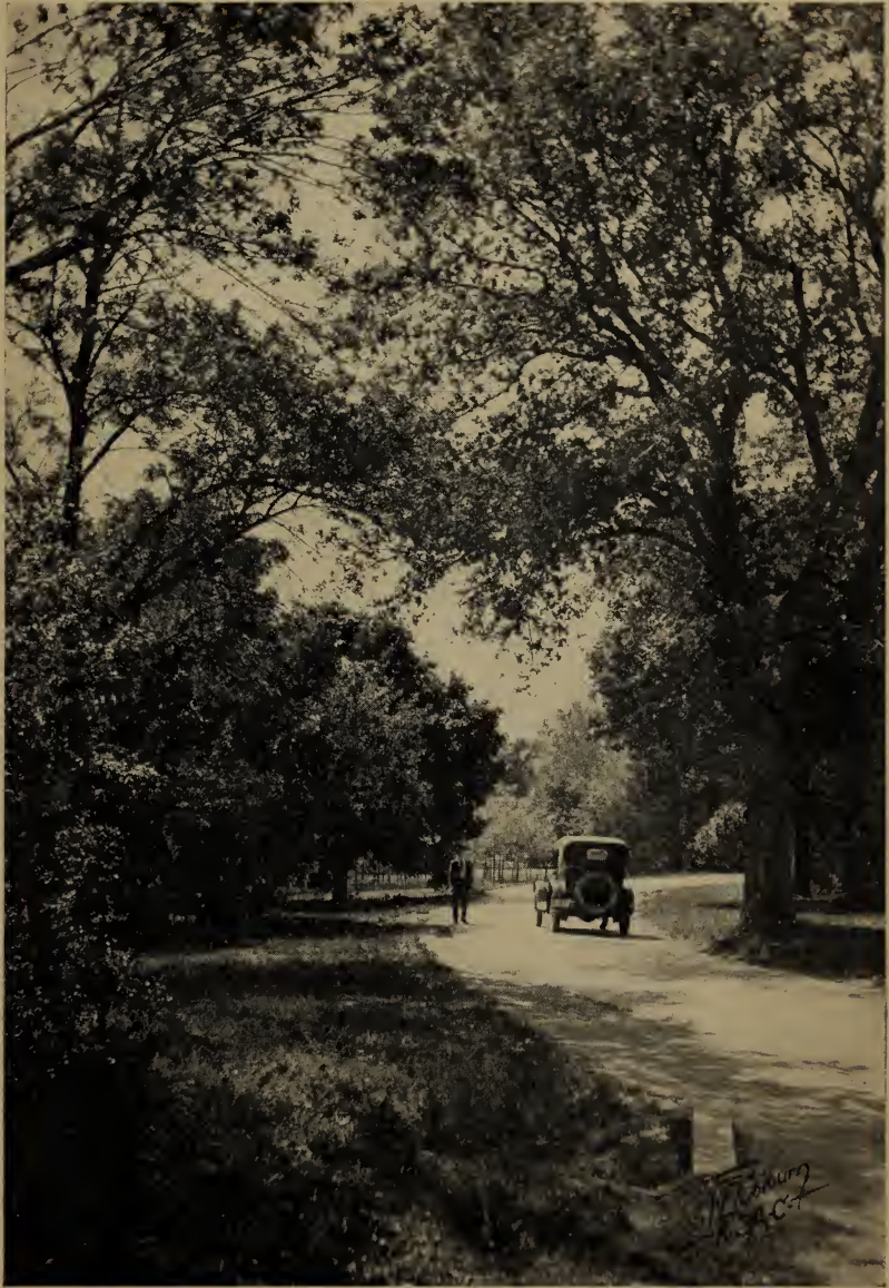
Coming and going on the campus