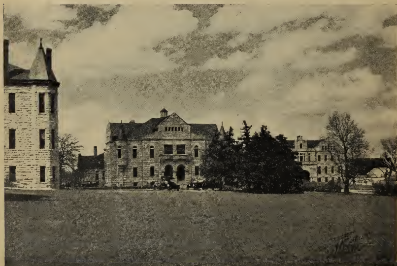
A view down the hillside