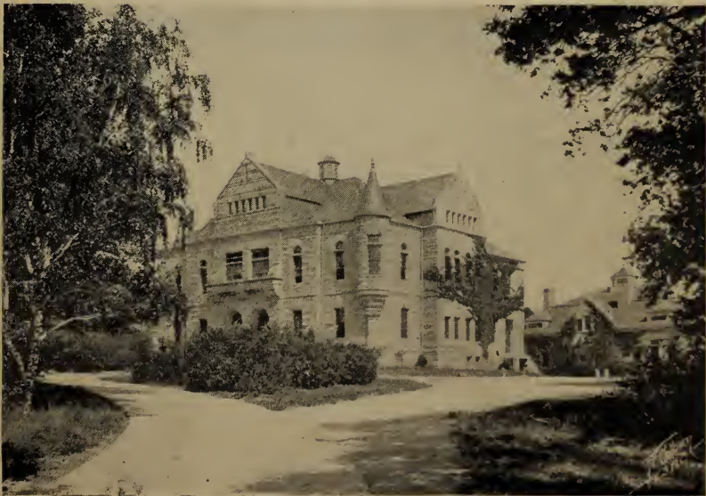
The School of Agriculture