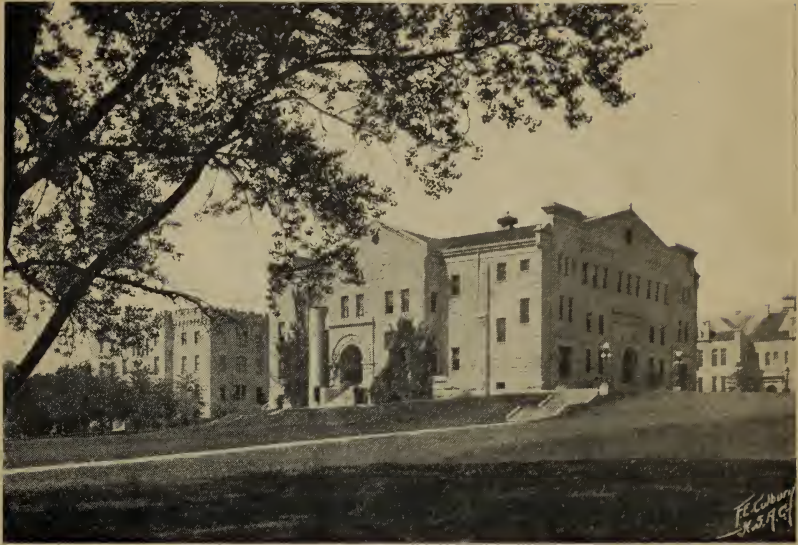
The Auditorium—home of music and drama