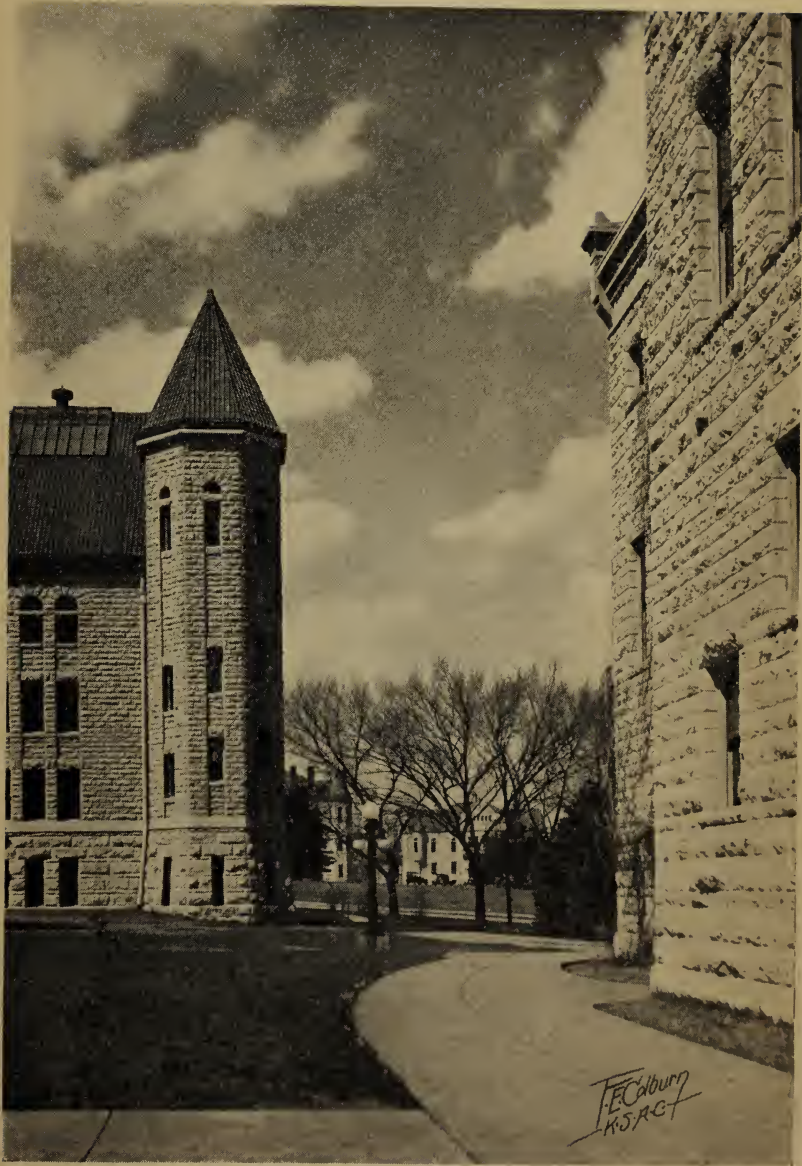
Everybody gone to class