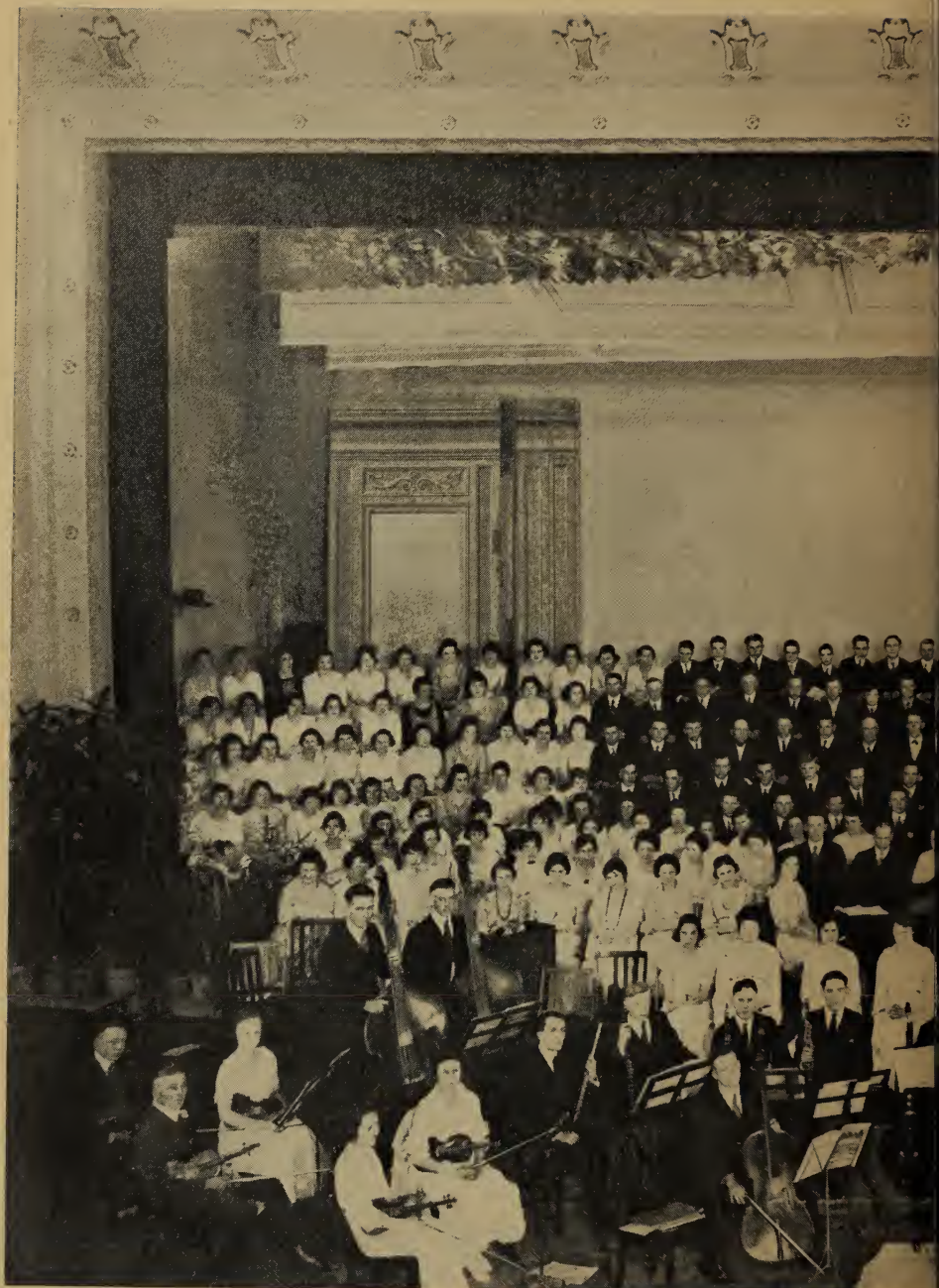
THE COLLEGE CHORAL Ready to give "Hiawatha's Wedding Feast,"