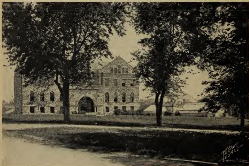
Where flowers and fruits are taught to grow