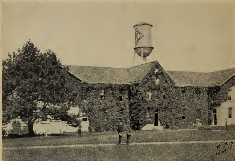
A part of the Engineering shops