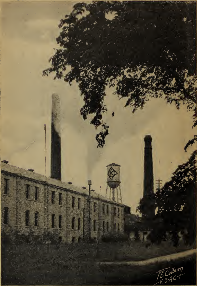
The power center of the College