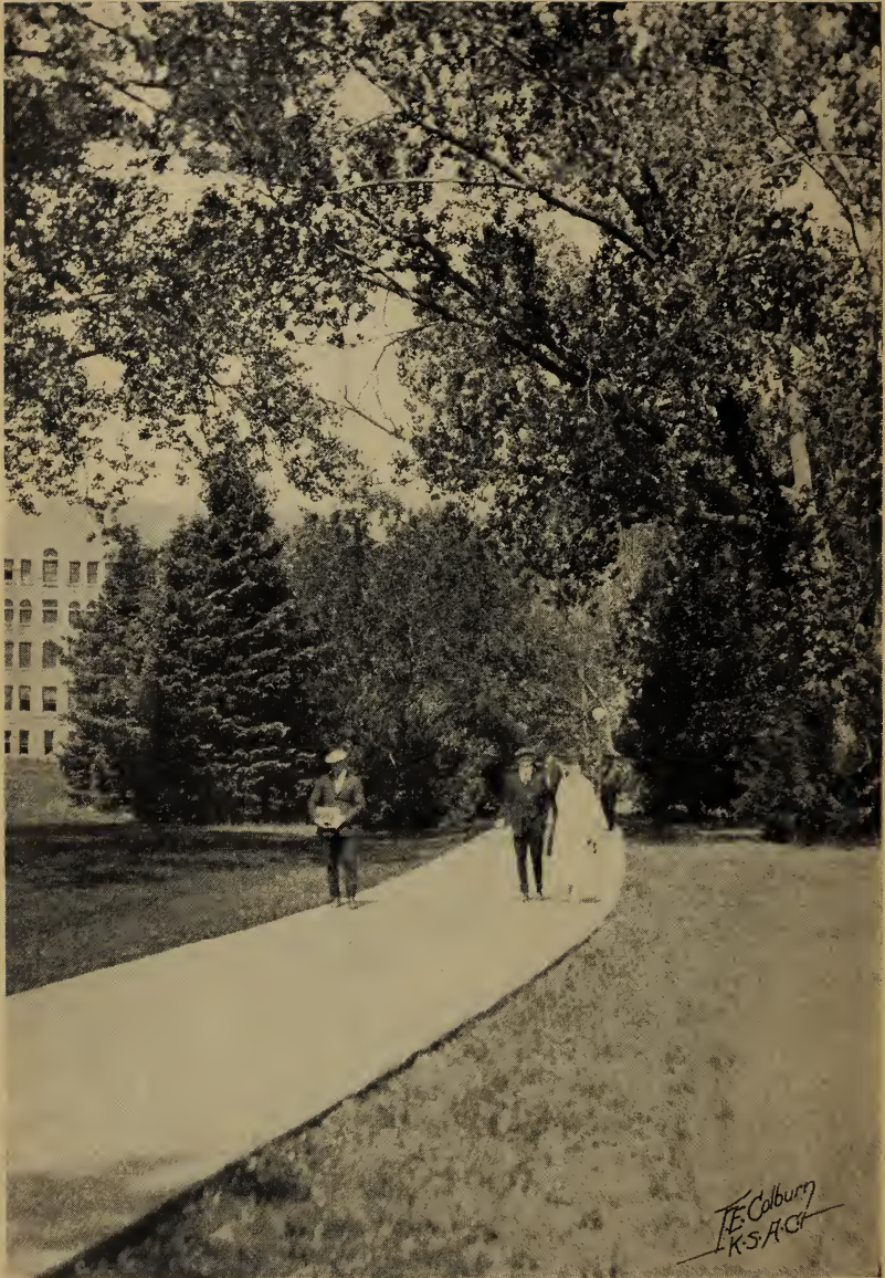
Coming home from "The Hill"