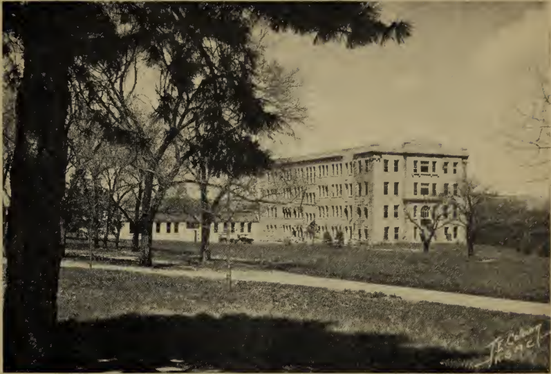
Waters Hall—the home of agriculture