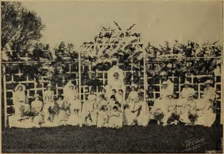
Lambs in May time