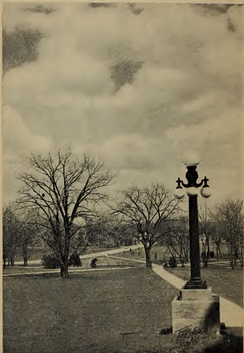
Even the sky helps make the campus beautiful