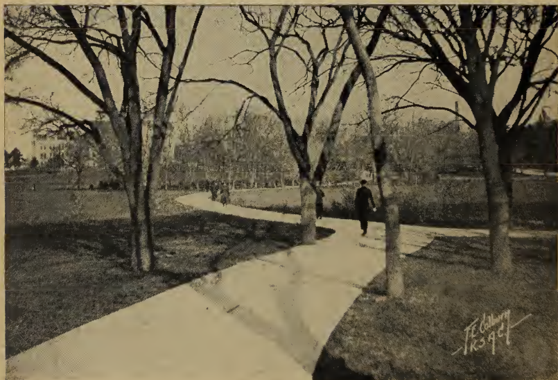
Sometimes you have to hurry