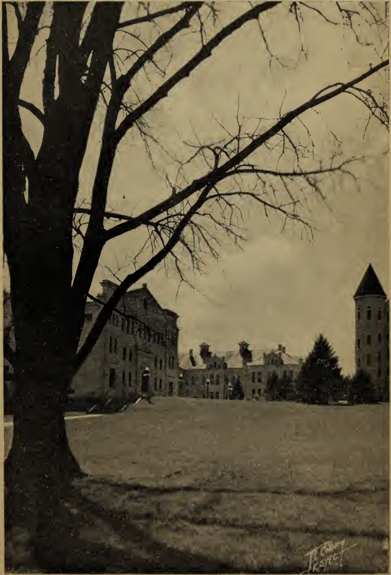
A glimpse of the Auditorium, Home Economics Hall, and the Library tower