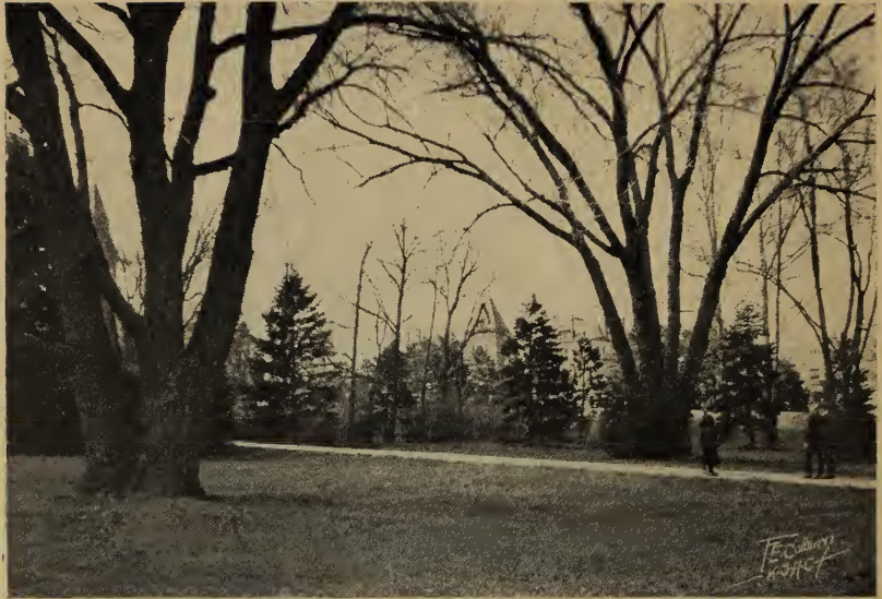
Why girls and boys leave home