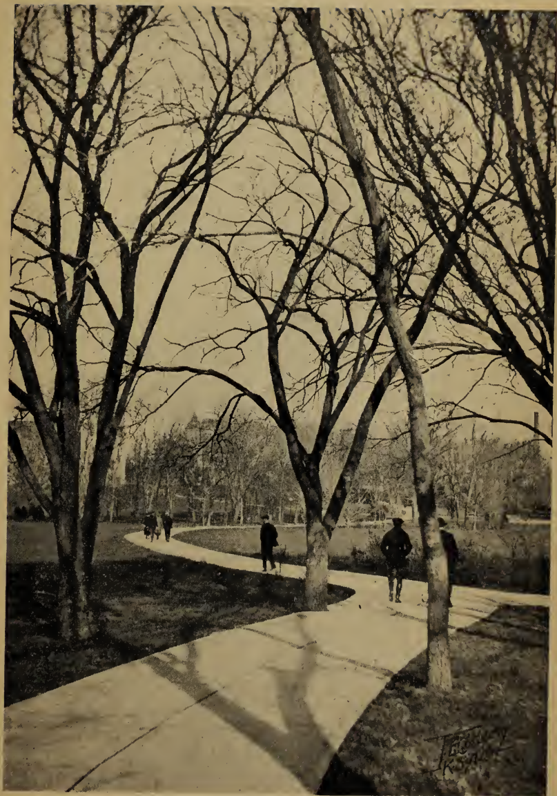
Early to eight o'clock classes—a good start