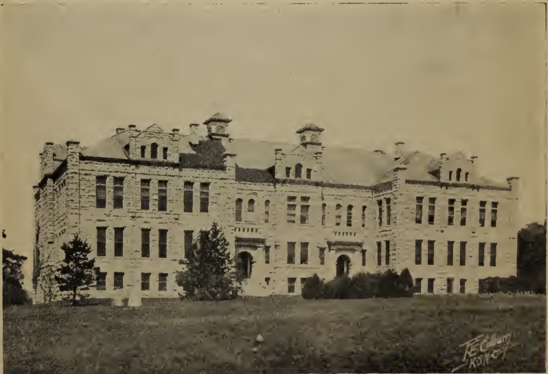
Home Economics Hall—home of homes