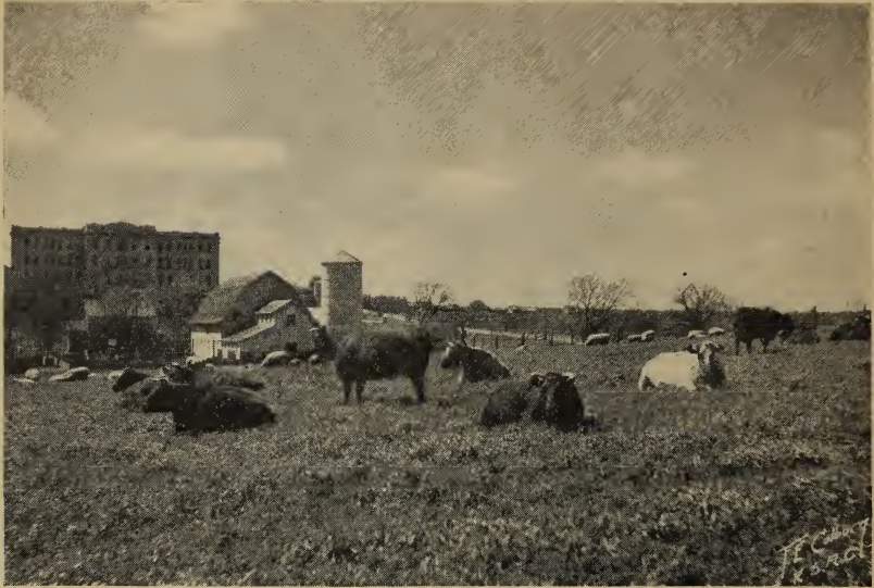
This is how we keep 'em—