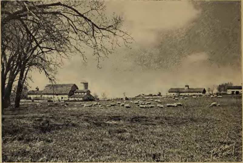
College sheep—none of 'em black